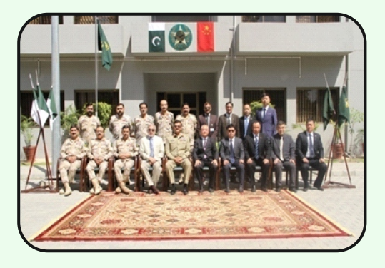
Chinese / UNODC high level delegation visited HQ ANF on 28 Sep 2018