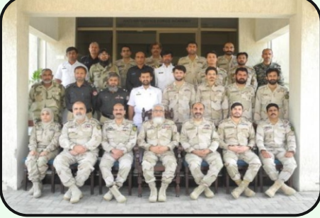
Preparation of Case File Course/ Workshop