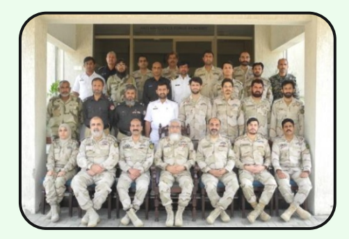
Interview and Interrogation Course