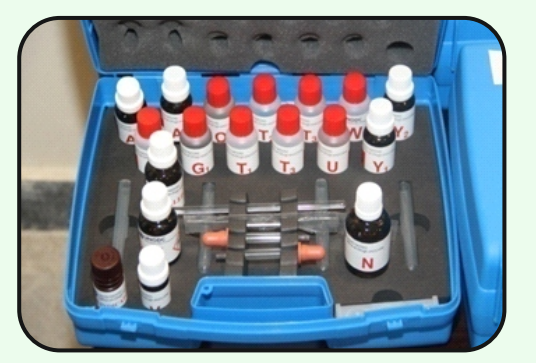
UNODC Drugs and Precursors Testing Kit handover ceremony was held on 13 Sep 2018 at HQ ANF